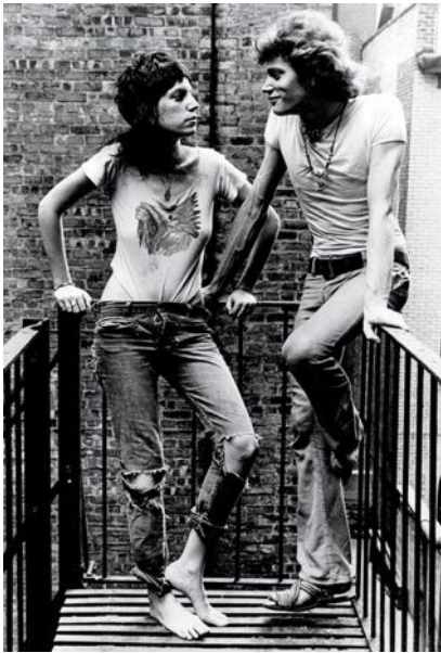
Patti Smith and Robert Mapplethorpe.

© Robert Mapplethorpe Foundation. Jointly acquired by the Los Angeles County Museum of Art and the J. Paul Getty Trust/partial gift of the Robert Mapplethorpe Foundation/partial purchase with funds provided by the J. Paul Getty Trust and the David Geffen Foundation.