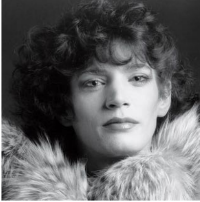
A 1980 self-portrait. Promised gift of the Robert Mapplethorpe Foundation to the J. Paul Getty Trust and the Los Angeles County Museum of Art.